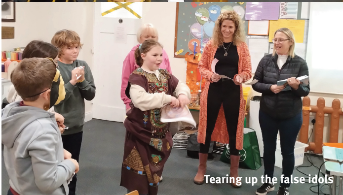
Tearing up the false idols