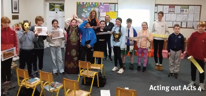
Acting out Acts 4